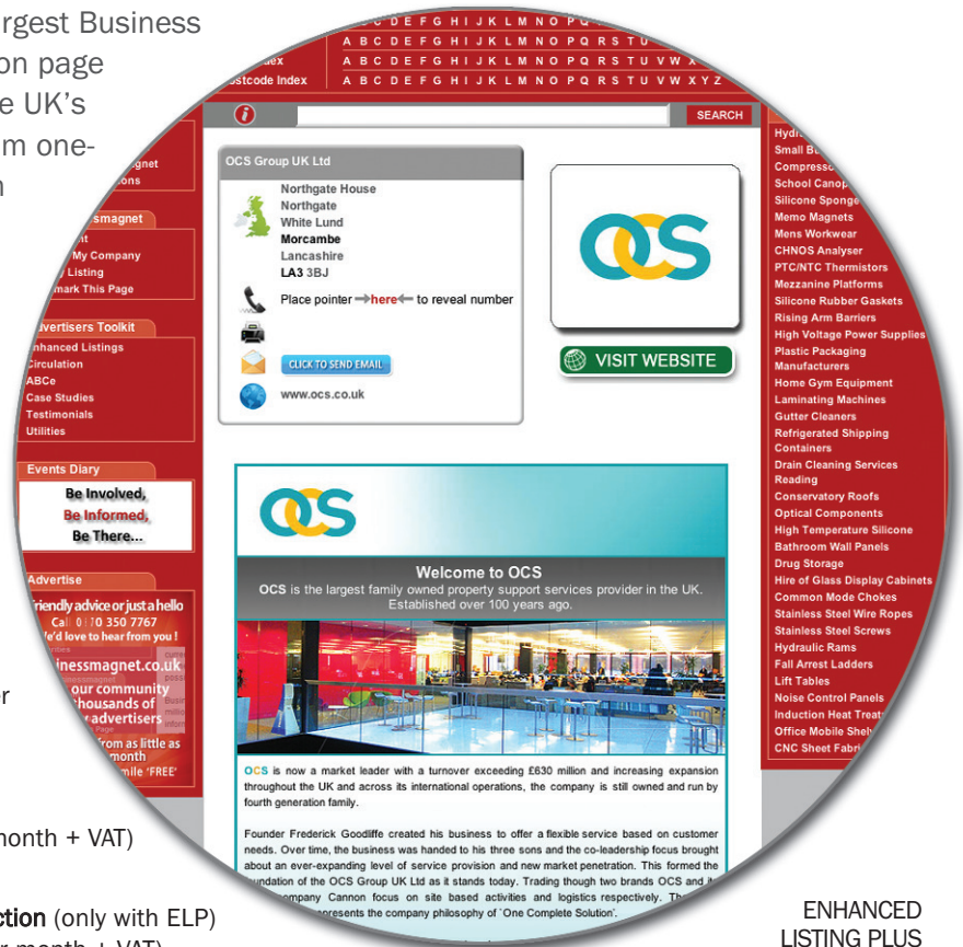
ENHANCED LISTING PLUS

To discuss your individual requirements and to find out how to attract the right results for your business, call 0870 350 7767 or email sales@businessmagnet.co.uk