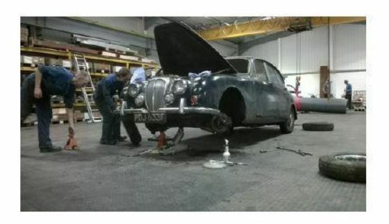
25<sup>th</sup> August 2016 – drives, but in need of restoratior

25th August 2016 - DAY 1 - 'pre-restoration'