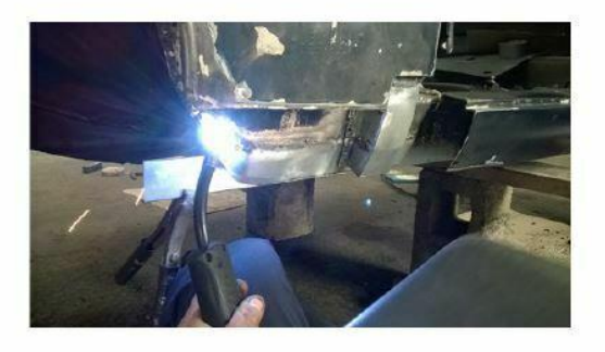
Daimler V8 250 PDJ633F

In some cases we couldn't get hold of original parts (it's a 51 year old car after all), so our highly skilled engineers made them from scratch to the highest possible standards.