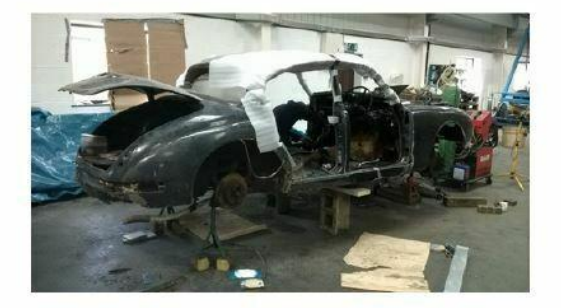
October 2016 - bodywork repairs start

September 2016 - Full strip down continues