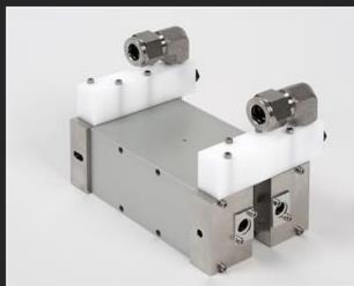
Candela Gentlelase Series