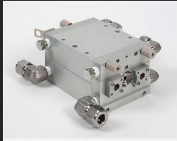
Cynosure Apogee Series