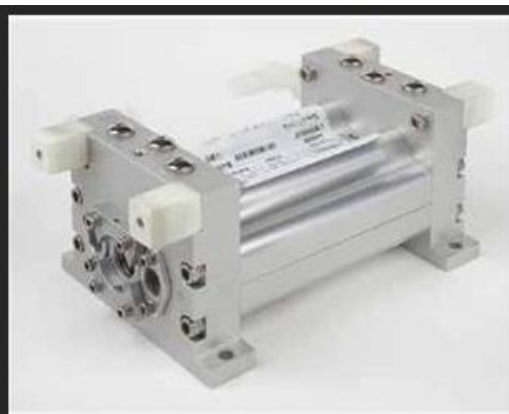
Cynosure Elite +, MPX