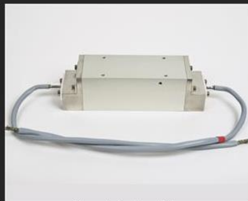
Quanta Series, Bios