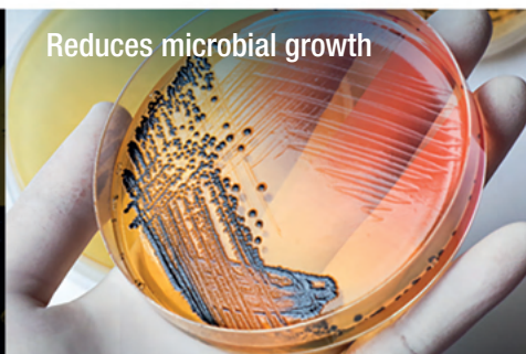
Reduces microbial growth