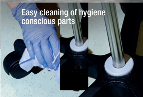
Easy cleaning of hygiene conscious parts

Fluregiene 200™ Protecting your surfaces for longer. Low friction PTFE based coating containing BioCote® antimicrobial technology