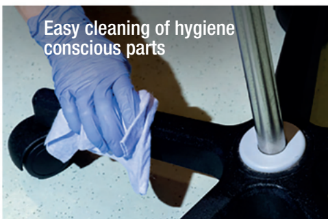
Easy cleaning of hygiene conscious parts