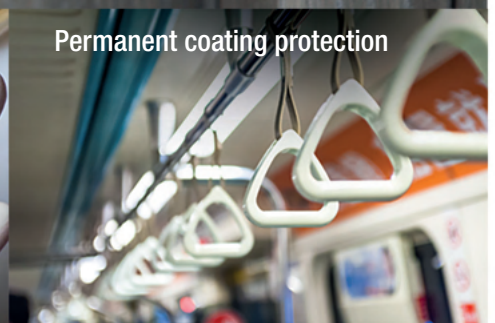
Permanent coating protection