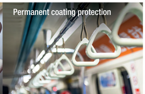
Permanent coating protection

For more information about Fluregiene 200™ call us now on +44 01386 425755 or email info@cwst.co.uk