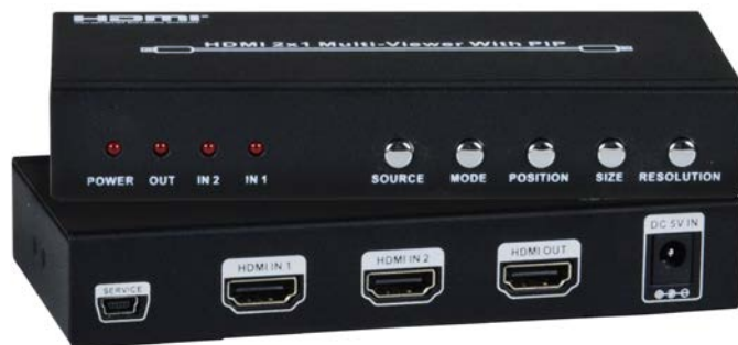
SPLITMUX-HD-2LC (Front & Back)