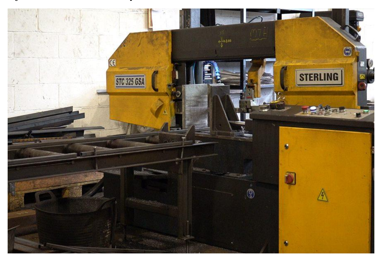
How is your experience with Selmach while ordering?

If we hadn't got the machinery that Selmach had provided us, we'd have to outsource everything, and as soon as you do that you lose control straight away, and you're paying a premium rate for something you could do yourself. As soon as I put something out of the door it's going to cost me 20% straight away. Having it in house it just works, and works every time.