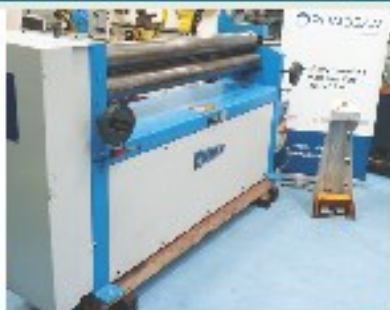
Techna-Fab AJR-3x1500 Pyramid Power Bending Rolls. £4,250