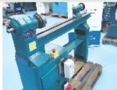
Viceroy TDS Wood Turning Lathe 36in 3-phase. £1,150