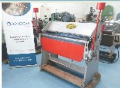
Morgan Rushworth Heavy Duty Box & Pan Hand Operated Folder. £2,850