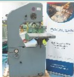
Thiel Segura Vertical Bandsaw. £1,750