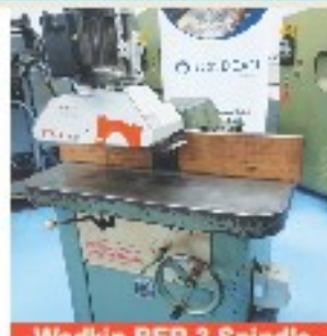
Wadkin BER 3 Spindle Moulder with Maggi Steff Auto Feed. £2,350