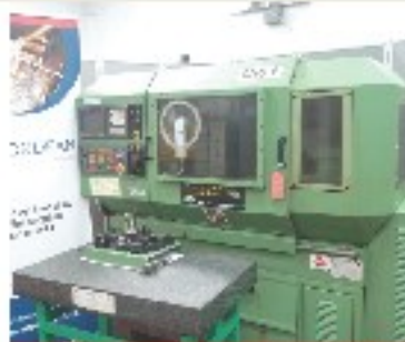
AVM Angelini Tornio CNC Centre Lathe. £8,750