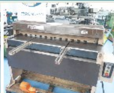
Edwards Minishear Powered Guillotine. £3,250