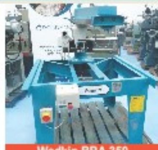
Wadkin BRA 350 Long-Arm Universal Radial Cross-Cut Saw. £4,850