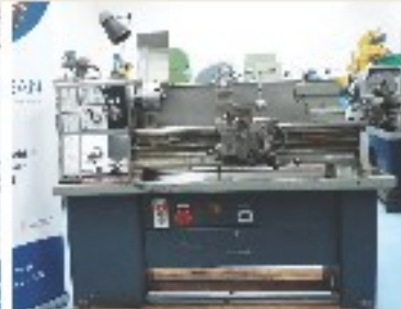
Colchester Bantam 2000 Mk2 30in (750mm) Gap Bed Centre Lathe. £4,750

80in (2,000mm) between centres, 16 1/2in (420mm) swing 24 1/2in (610mm) in gap, 65mm bore, taper turning. £10,750