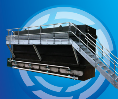
Advanced SAF technology