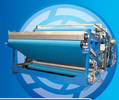
Belt press technology