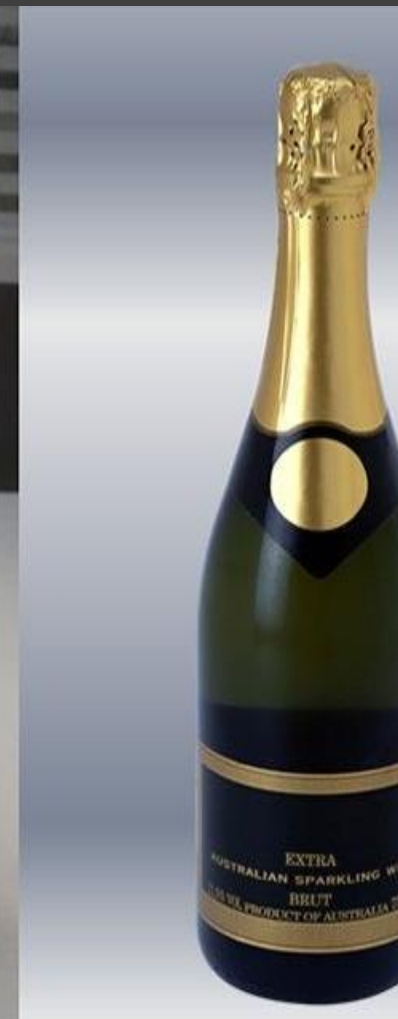
Wine Beer and Spirit Bottles