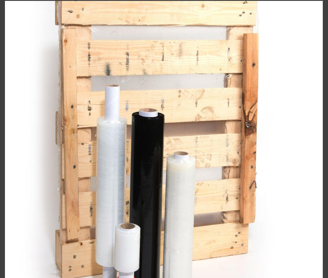
Pallet Wrap and Packaging Materials