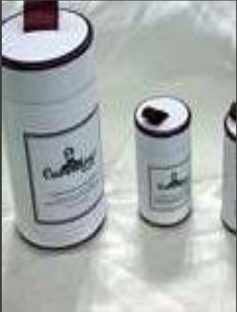
Retail Counter Displays and Gift boxes that can be custom made to your size and print