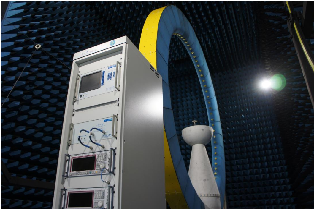
Pictured: Stargate – Testing wireless connectivity at Cranage EMC & Safety, UK.

We offer a host of technical and product-testing services from our UKAS accredited facilities in the UK. We also offer many 'tailored' solutions for evaluating products, such as compliance testing against published standards in a controlled laboratory environment or field evaluation at manufacturing premises.