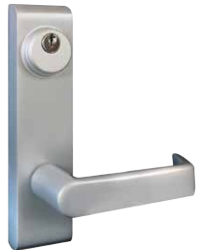
Outside lever handle