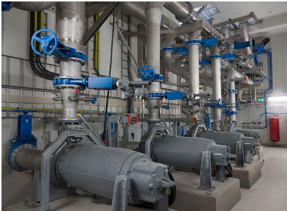
ALL VALVES ONLINE – STAFSJO KNIFE GATE VALVE DISTRIBUTOR