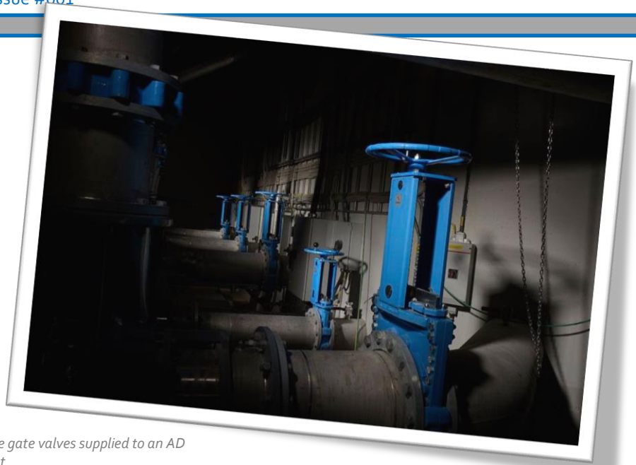
Knife gate valves supplied to an AD plant.

This project exposed All Valves to the product portfolio of STAFSJO and since then All Valves have worked hard to always promote and specify the brand wherever possible. This has resulted in All Valves supplying high end applications with high performance knife gate valves, AD and Biogas and WWT plants.