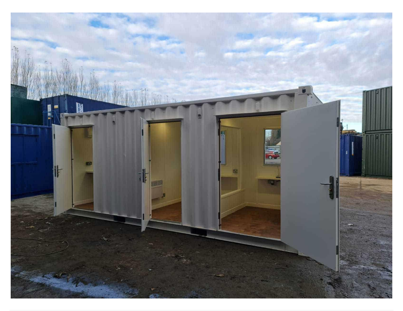
20 x 8 container care pod exterior for social distancing 1