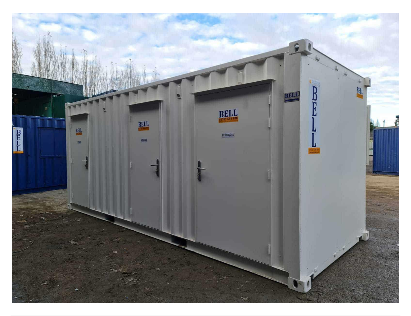
Bell Container Social Distancing Care Pod