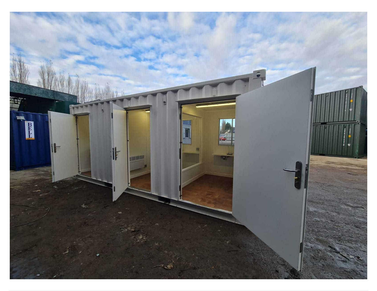
20ft Bell Care Pod for Care Homes