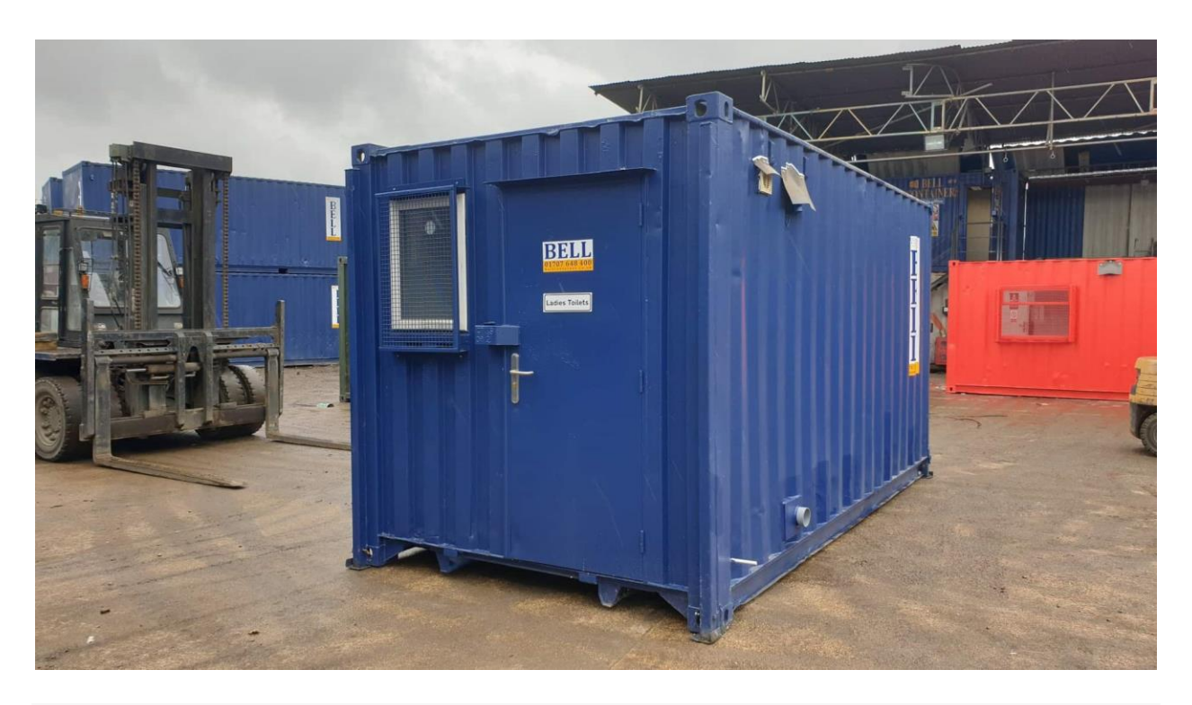
16ft bespoke canteen and toilet block London sales fleet