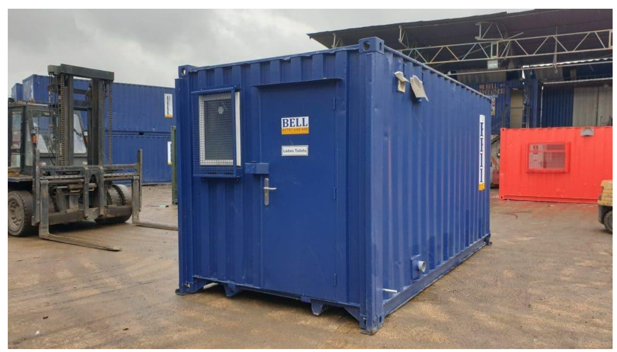
16ft bespoke canteen and toilet unit

We were asked to supply an all in one canteen and single mains toilet block, for a new customer, who wanted a cost-effective, yet long-term site accommodation solution for mulitple projects across London and the South East.