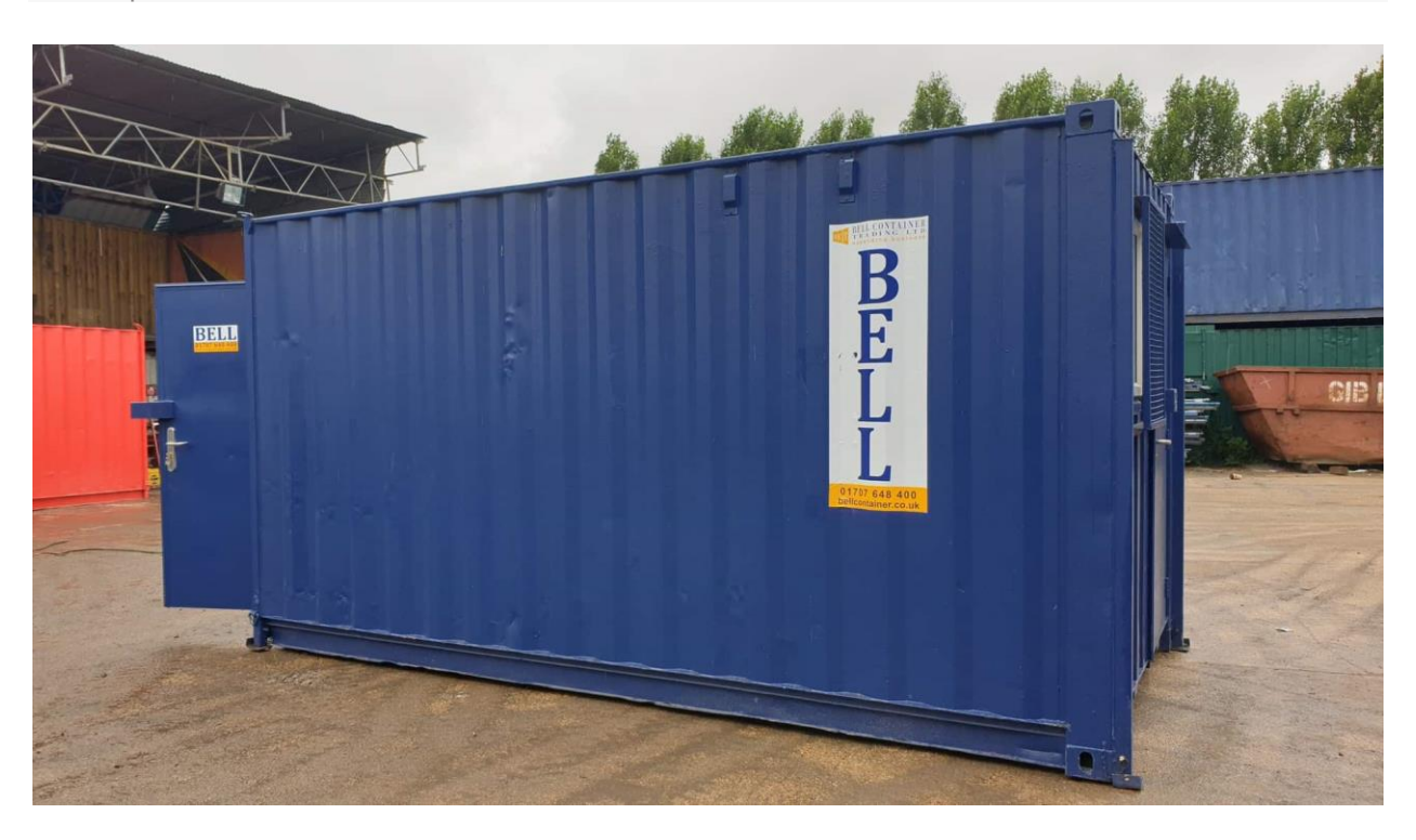
16ft canteen and toilet block conversion