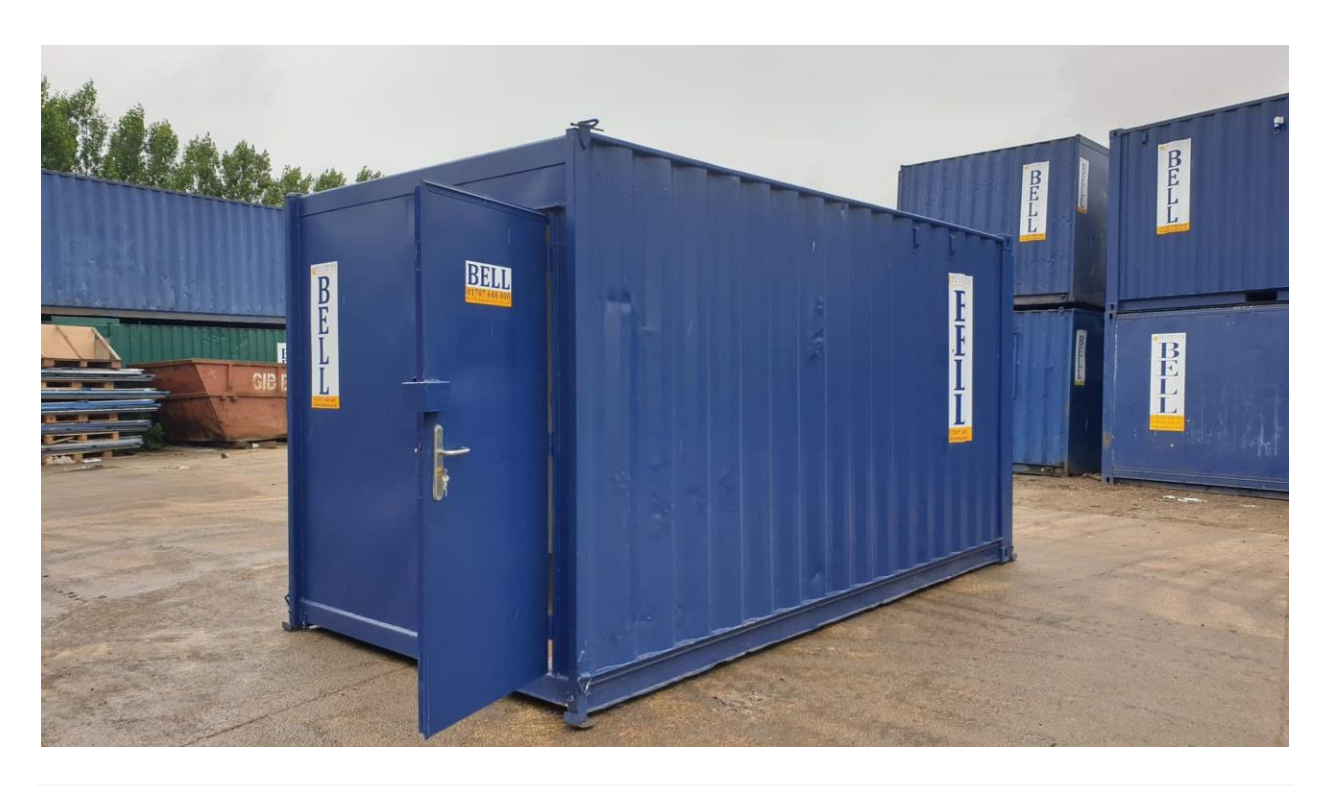
16ft toilet and canteen unit external sales London depot