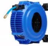
Heavy Duty UPVC Spring Driven Hose Reel for Air and Water