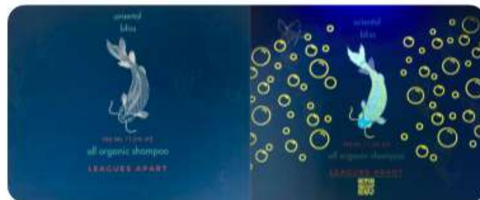
UV Detectible Varnish (with and without UV Light)

Whilst print is a good way to create a really well-designed label, it could also be used for security, or to add another element of flair. By using UV detectible varnished, we can supply you with a label design that only you know is there. This can be fantastic from a security point-of-view as it allows you to verify the validity of an item. They are fully customised to your design, and can be produced as a continuous piece, or just in a discrete section within the label, to your design.