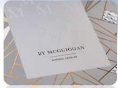
Metallic Foiling and Embossed Texture

Whilst print is a good way to create a really well-designed label, it could also be used for security, or to add another element of flair. By using UV detectible varnished, we can supply you with a label design that only you know is there. This can be fantastic from a security point-of-view as it allows you to verify the validity of an item. They are fully customised to your design, and can be produced as a continuous piece, or just in a discrete section within the label, to your design.