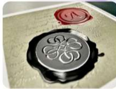
Dual-height Textured Varnishes