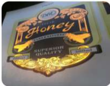
Bright Gold Hot-foil

Hot-foiling is another way for you labels to stand out. Using brightly coloured foils, we can create an almost mirrored look in a wide variety of colours.