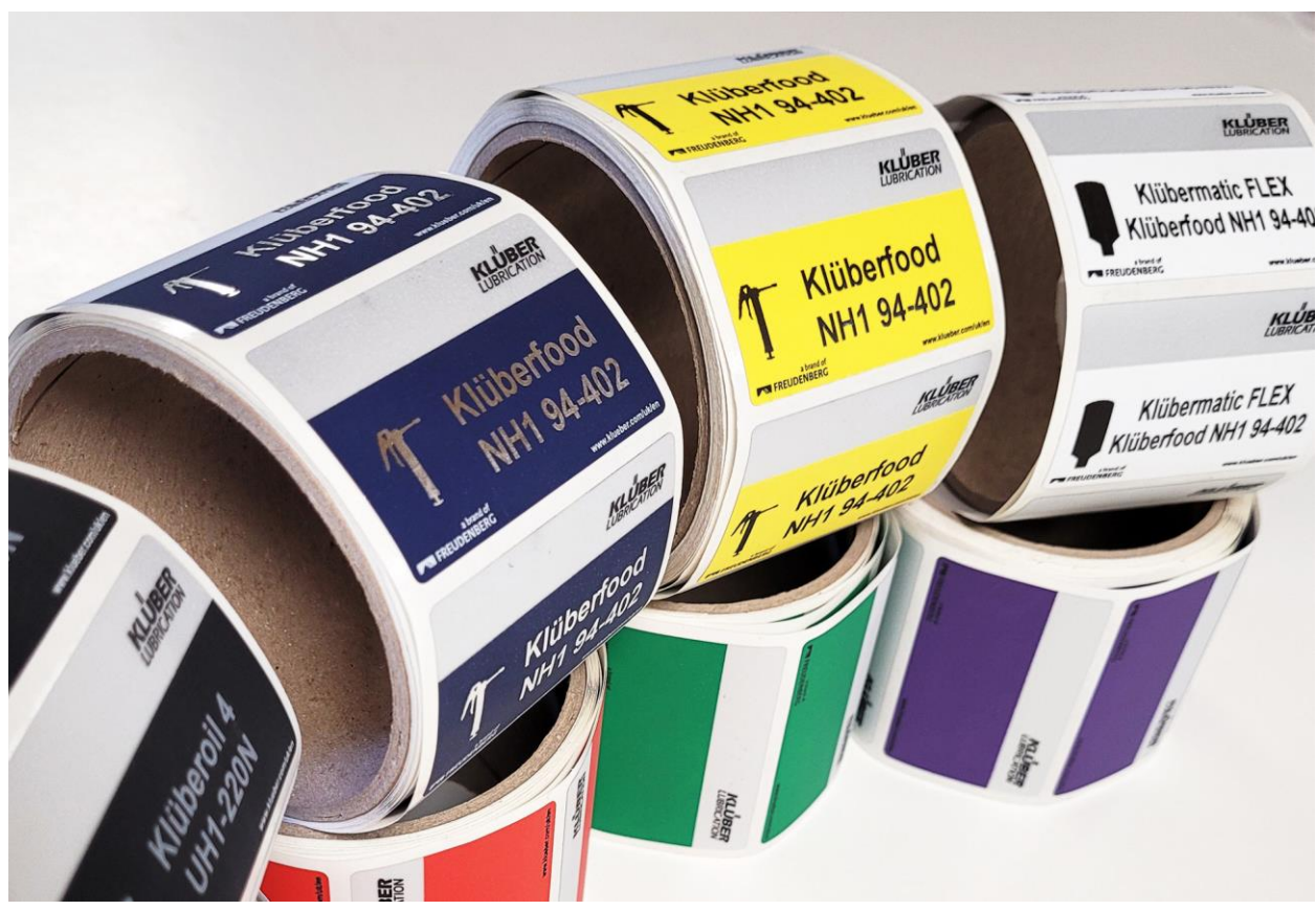
The final Labels, including blank samples.