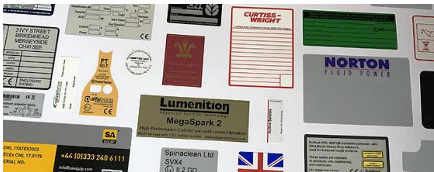
Metallised, polycarbonate and ultra bond labels.

Whatever you currently use to label your assets, we believe now is a great time to reevaluate the quality, durability and cost of your labelling . As manufacturers of high-performance, durable labelling at the forefront of the industry, we've become very good at saving businesses money while providing a superior product in every way .