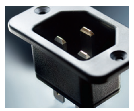
SCHURTER's 1681 IEC appliance inlet

Electric grills, heating devices, powerful projectors, data servers or lighting systems: these are all appliances that generate a high degree of heat during operation. Such appliances place special demands on the power supply. Inherent risks such as overheating, short circuits, burns or electric shocks must be reliably prevented for safe operation. Hot appliance inlets according to the IEC 60320-1 component standard guarantee this safety, as well as the compatibility of products from one manufacturer to the next.