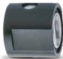
Quick-action bayonet coupling