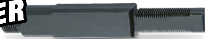
Draw stud for hydraulic operation