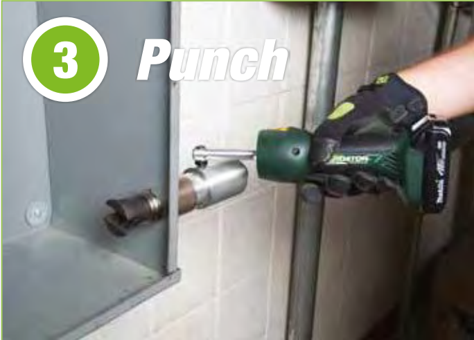
Punch hole: Save time and money with every punch!

Secure SPEED LOCK onto draw stud: Faster setup and disassembly.