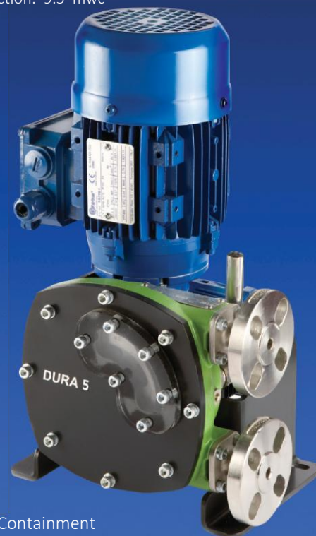
Verderflex Dura 5 & 7 Flow: max. 39 l/hr Pmax: 8 bar Suction: 9.5 mwc