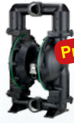
3" (76 mm)