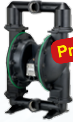
2" (51 mm)