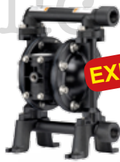
3/4" (19 mm)