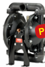
1" (25 mm)