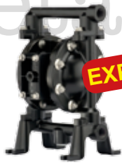
1/2" (13 mm)