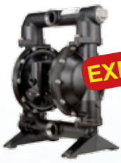
1 1/2" (38 mm)