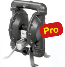
1 1/2" (38 mm)