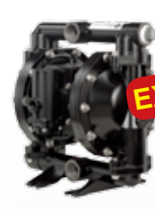
1" (25 mm)