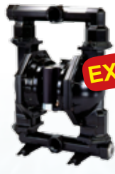
2" (51 mm)