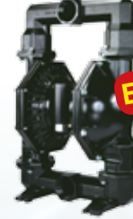
3" (76 mm)