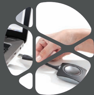
Simply Audio Visual