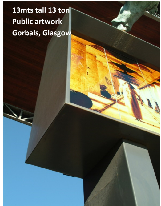
13mts tall 13 ton Public artwork Gorbals, Glasgow