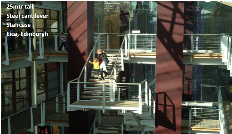
25mtr tall Steel cantilever Staircase Eica, Edinburgh