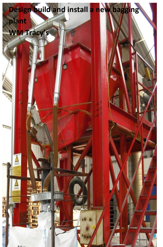
Design build and install a new bagging plant WM Tracy's