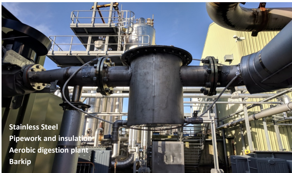
Stainless Steel Pipework and insulation Aerobic digestion plant Barkip