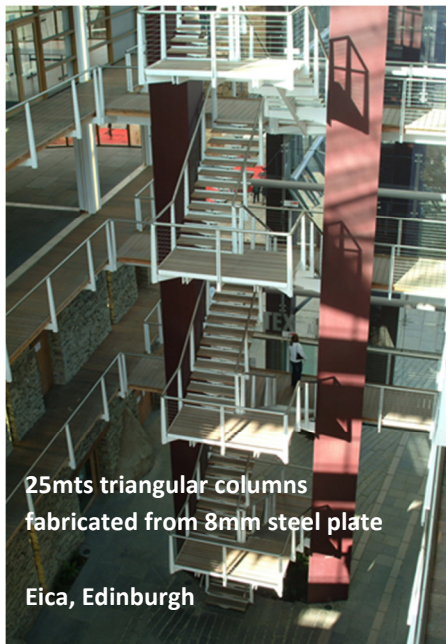
25mts triangular columns fabricated from 8mm steel plate