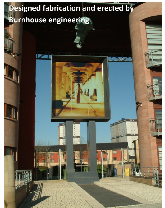
Designed fabrication and erected by Burnhouse engineering