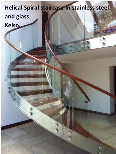
Helical Spiral staircase in stainless steel and glass Kelso.