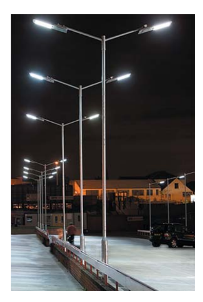
Jupiter 48 XL100 -LED Street Light with Out Reach Arm by Gemma Lighting.