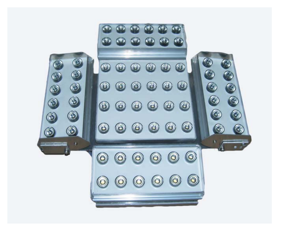
Gemma Lighting's Sun 72 XL100 -LED Flood Light unit.

For more information, click www.businessmagnet.co.uk/advertise